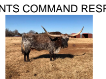
HUNTS COMMAND RESPECT