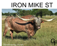
IRON MIKE ST