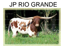
JP RIO GRANDE