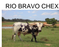
RIO BRAVO CHEX