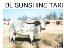
BL SUNSHINE TARI