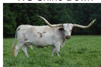
WS Shine Down