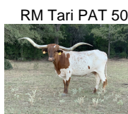
RM Tari PAT 504