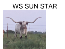
WS SUN STAR