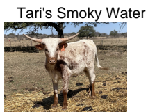
Tari's Smoky Water