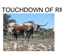
TOUCHDOWN OF RM