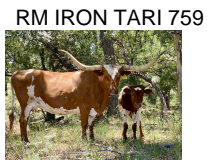
RM IRON TARI 759